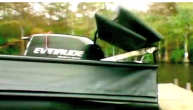
Aft protection while triggering the inflation