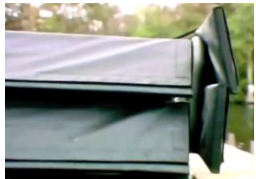
Aft protection seconds after inflation triggering