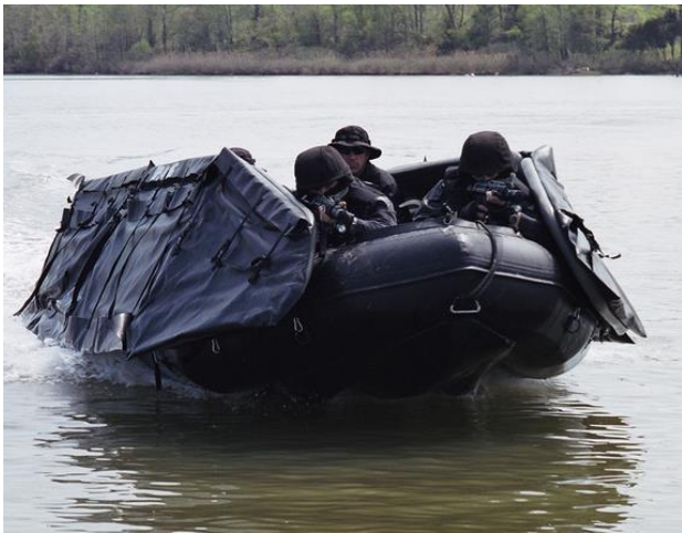
Crew navigating with ArmorFlate deployed