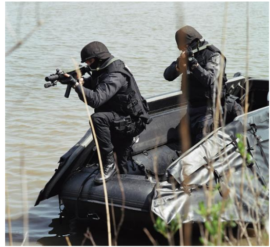
Crew landing with ArmorFlate deployed